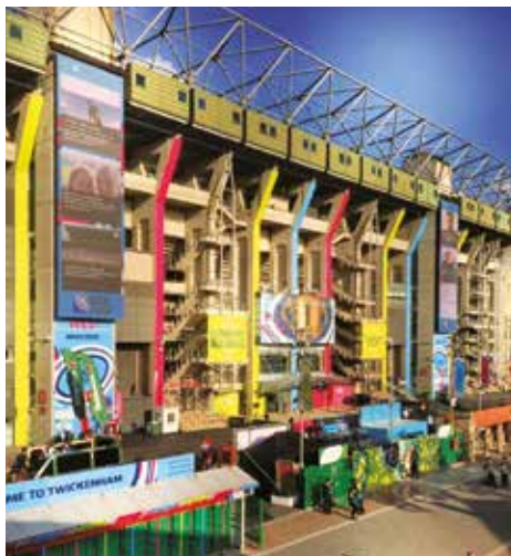
Crowd Reactive's social media feeds at Twickenham during the Rugby World Cup 2015