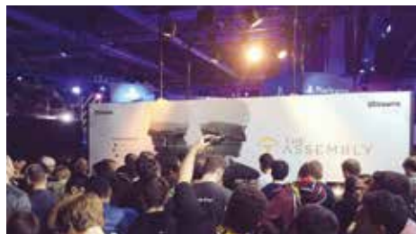
Crowds queue for over two hours to play nDreams' The Assembly game at the EGX conference in Birmingham on Thursday 24 September 2015