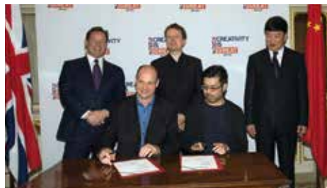
Edge Case Games founders signing the investment and collaboration agreements with Tony Ji Zeng from Kingsoft Corporation, alongside Ed Vaizey (Minister of State for Culture, Communications and Creative Industries) during the visit of China's President Xi Jinping